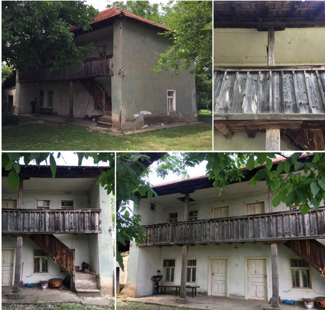
Figure 5. Photographs of Petković's family house in Laplje Selo