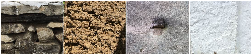
Figure 3. Photograph of used materials during construction of Petković family house in Laplje Selo

Wood was used to perform the structural system, straw and fiber was used as a binder and the mortar that was used could be characterized as a new source.