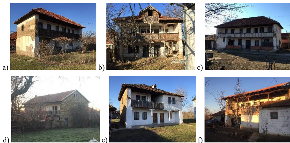
Figure 1. Photographs of two-storey family houses in central Kosovo and Metohija. a) Popović family house in Gračanica; b) Marković family house in Gračanica; c) Nikolić family house in Gračanica; d) Čurčić family house Dobrotn; e) Miljković family house in Livadje; f) Maksimović family house in Dobrotn

Like the ground floor houses, two-story houses in the vicinity of Priština were covered “ ćeramida “ (ceramic roof tile) and have small and narrow windows, often two placed close to each other. The lateral, gable walls are thick and are usually made of broken stone, while the other walls are made of brick. At approximately meter of height, wooden beams are inserted into the wall, which are used for tightening and leveling the layers, functioning as ring beam nowadays. The roof sometimes contains an eyebrow dormer, so called “ badža “, to illuminate the attic, and a chimney, so called “ odžak “, to let smoke out of the furnace. The chimney is rectangular in shape in its base, covered with “ ćeramida “ typical of Kosmet, which occurs in the area in the same shape [10].